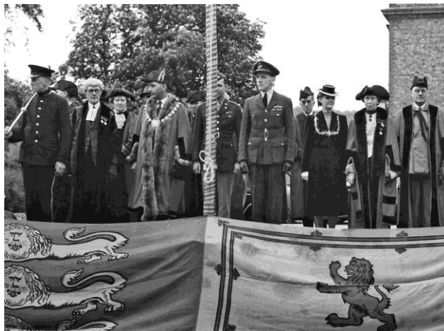
Civic Party in Blandford Forum, 2 nd June 1945