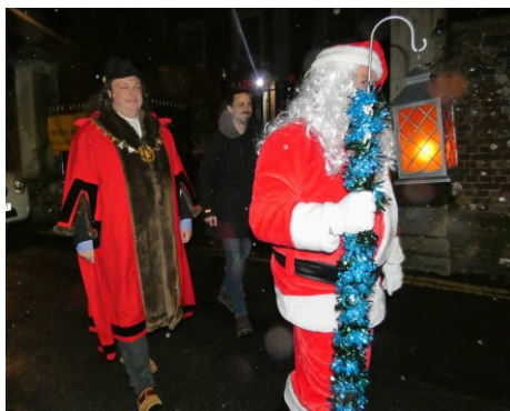
Blandford Yuletide Festival