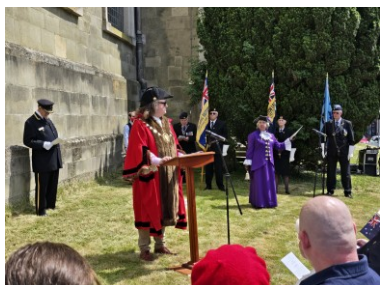
D-Day 80 Proclamation Service