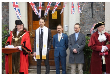
VE Day 80 Proclamation Service