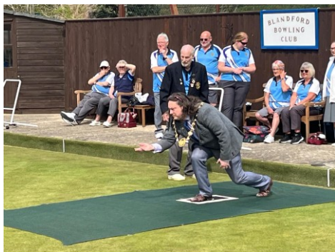
Bowling the first wood at the Bowling Club!