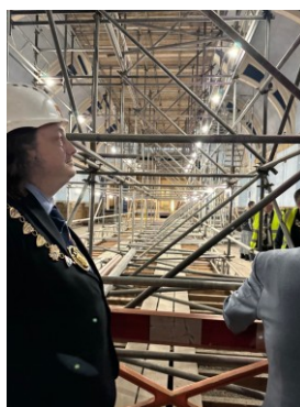
Corn Exchange tour