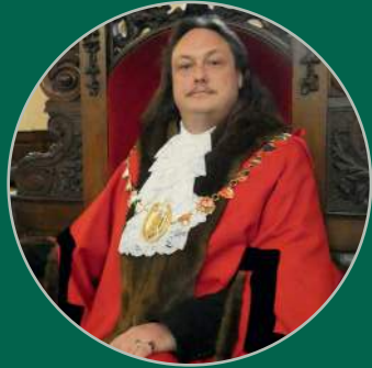
Current Mayor Cllr Nocturin Lacey-Clarke

The Town Council comprises of 16 Local Councillors